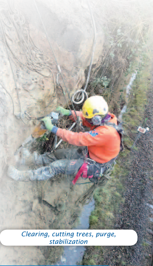
Clearing, cutting trees, purge, stabilization

“ From securing people to securing property, each of our actions resulting from a strategic reflection on sustainable investment contributes to the constitution of resources. This virtuous circle generates more comfort, quality and added value.”