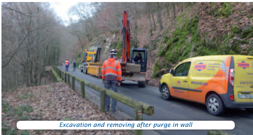
Excavation and removing after purge in wall