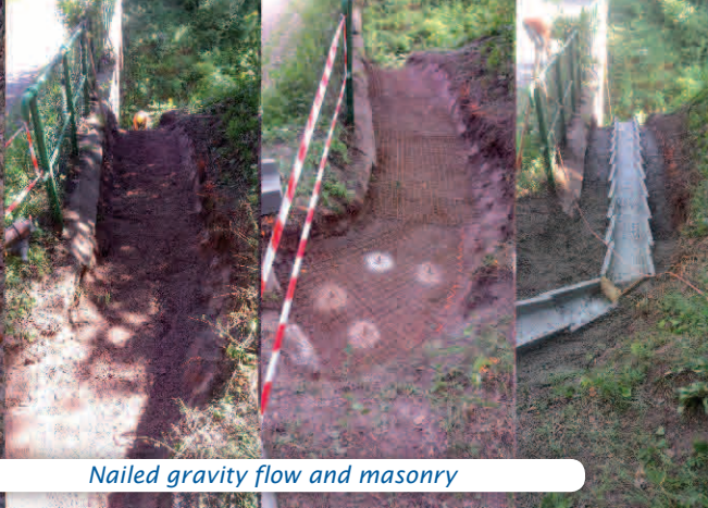
Nailed gravity flow and masonry