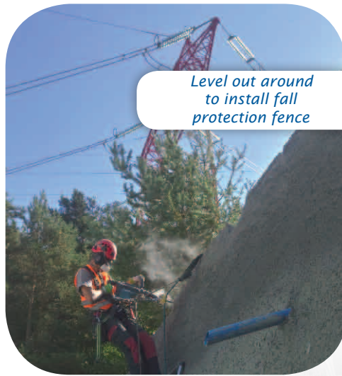
Level out around to install fall protection fence