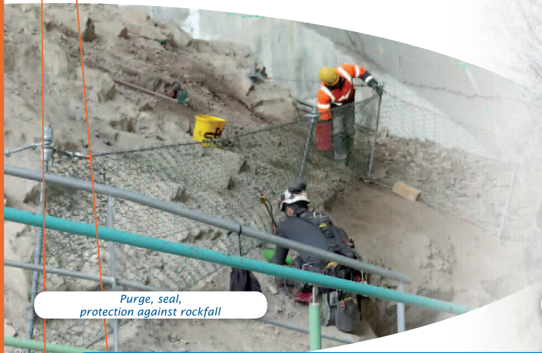
Purge, seal, protection against rockfall